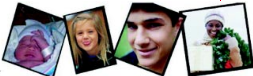
I just met my grandma via e-mail.