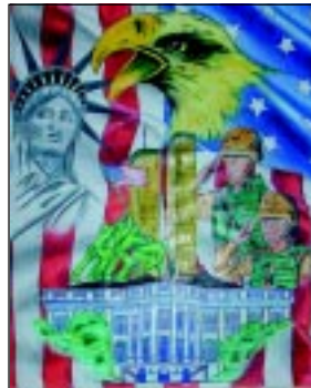
RTMC Winning Cover