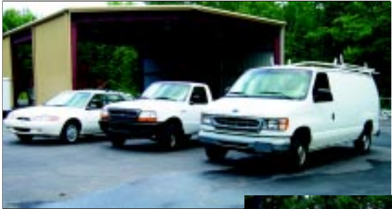
Left: Ford Escort Wagon, Ford Ranger Truck, & Ford E150-Van