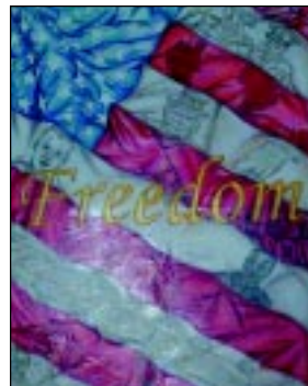
RTC Winning Cover