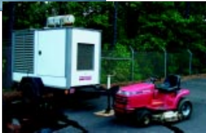
Below: Kohler Electric Generator & Honda Riding Mower

Sealed Bids Must Be Submitted By 11 a.m., June 29